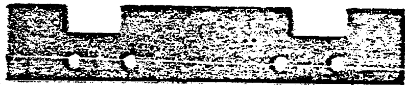
Fig. 3 Coin Insert Retainer